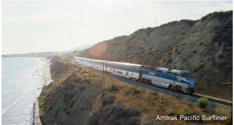
Amtrak Pacific Surfliner